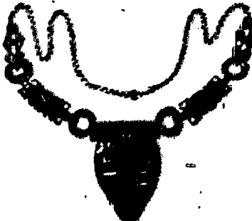
Sparkling Rhinestone Necklace with center of Oval and Baguette Cut-Crystals, $3.95. Others, all metal or set with simulated precious stones, $1.00 to $16.95.