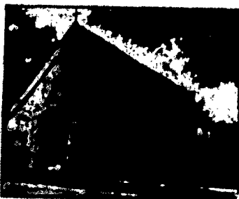
Grand and West Fine Streets