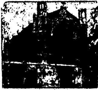
534 OXFORD STREET

Wagner's LIQUOR STORE MONROE 1187 677 Monroe Ave., near Oxford