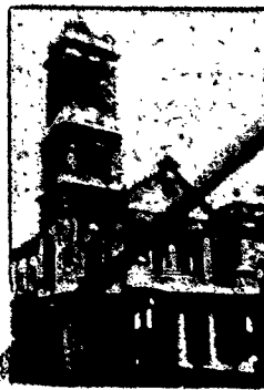
1095 JOSEPH AVENUE