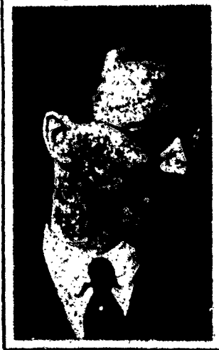
F. J. SHEED

Topics Listed "The New Apologetic," the lecture to be given here next Sunday evening incorporates much of this new Sheed technique. F. J. Sheed is the principal worker with Cardinal Hinsley in the new "sword of the spirit" campaign in England. Author of "Communism and Man," "The Map of Life," "Poetry and Life," and "The Nullity of Marriage" are some of F. J. Sheed's works. He has just finished a new translation into modern English of