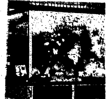
Dome... Florist ... 1384 Culver Rd., where artistic floral bouquets are created for every occasion. Call Col. 2868... for your St. Patrick's Day flowers.

Donut Centers Inc. Select your nearest Donut Center, their Donuts are the best in town. So many varieties to choose from, serve them every day, for breakfast, lunch and dinner. For your convenience... 487 Main St. E... 504 Main St. W... 1460 Lake Ave.