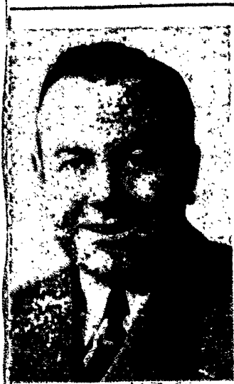
Andrew C. McCarthy