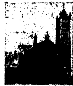
720 MAIN STREET WEST