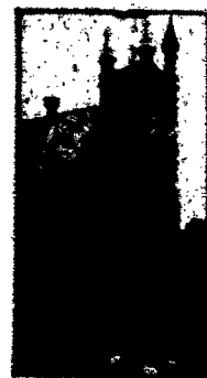
LYELL AVE. and ALSTIN ST.