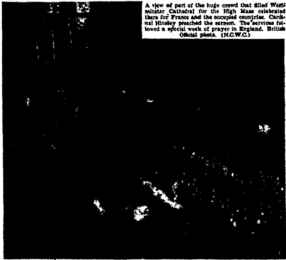
A view of part of the huge crowd that filled Westminster Cathedral for the High Mass celebrated there for France and the occupied countries. Cardinal Hinsley preached the sermon. The services followed a special week of prayer in England.