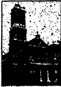
1095 JOSEPH AVENUE

For Prescriptions and Cut Rate Drugs—Come to BLESS DRUG STORE STONE 6903 856 Joseph Ave., cor. Avenue D