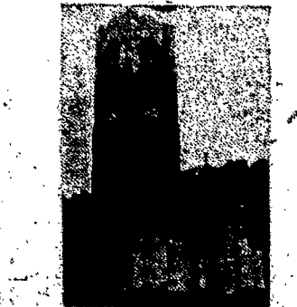
CHILI AVE. and LOZIER ST.

"See FURSTOSS First" FOR YOUR GAS & ELECTRIC APPLIANCES 409 Chili Ave. Gen. 2070