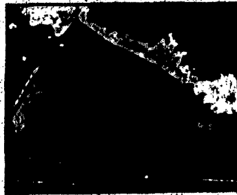
Grand and West Pine Streets

Pasteurized Milk & Dairy Products Ice Cream & Frozen Specialties JUNE'S CREAMERY and ICE CREAM CO. 299-305 Main St.—Telephone 89 HORNELL, NEW YORK