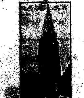
158 STATE STREET

SLINDERIZE WITH ULTRA FORM "The Proven Method" Spot Reducing—Muscle Toning. No Tanning Diet Visit our new Body Contour Department for a free consultation. Cameo Beauty Salon 45 E. Market St. Corning, N. Y.