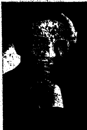
Archduke Felix of Austria