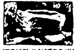
JESUS' MANGER WAS PROBABLY OF STONE! NATIVE ROSE-GOLD, LIMESTONE MANGERS HAVE BEEN EXCAVATED IN PALESTINE.

THE BASILICA OF THE NATIVITY IN BETHLEHEM, SHARED BY LATIN, GREEK AND ARMENIAN CHRISTIANS IS ON THE TRADITIONAL SITE OF THE STABLE IN WHICH JESUS WAS BORN.