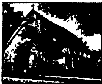
Grand and West Pine Streets HORNELL, N. Y.