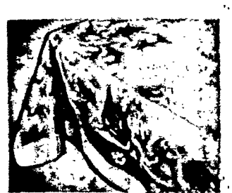
50x50 Printed Table