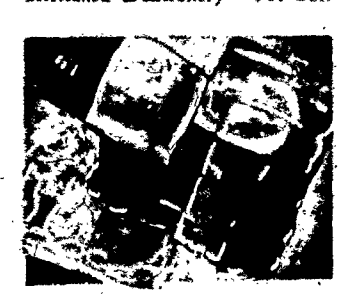
Irish Liner Handkerchiefs 29c