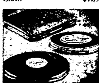
Gompacts ($1.25 & $1.00