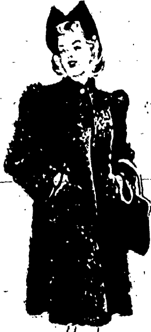
Rochester's Largest Exclusive Manufacturing Furriers

You'll find values that have made this a record year for Graeser FURS!