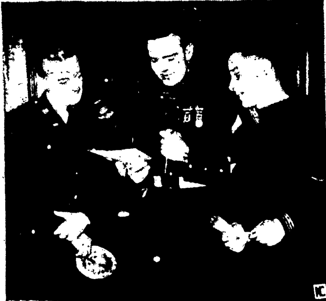
One of the latest innovations for men of the armed forces to be provided by USO clubs operated by the National Catholic Community Service, is a "Talking Christmas Card." Shown at the USO-NCCS club in New London, Conn., are a soldier, a marine and a sailor, recording their vocal holiday greetings to be sent to the folks back home.