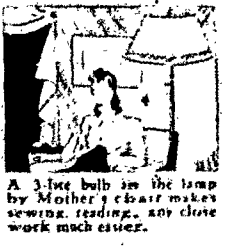
A 3-luc bulb in the lamp by Mother's chair makes sewing, reading, or close work much easier.