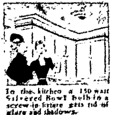
In the kitchen a 150-watt Silvered Bowl bulb in a screw-in fixture gets rid of glare and shadows.