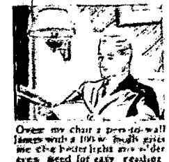
Over my chair a 100-watt lamp with a 100-watt bulb gives me the better light and under eyes need for easy reading.