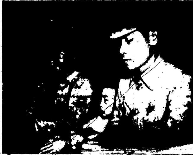
A Chinese soldier fingers his Rosary. In this view from war-torn China, the soldier wears his hat. The soldier wears his hat. Customs seem to be different in the Orient. There are no captains for the 20,000 Catholic soldiers in the Chinese armies, but their faith is an inspiration to their comrades, and many conversions are reported.