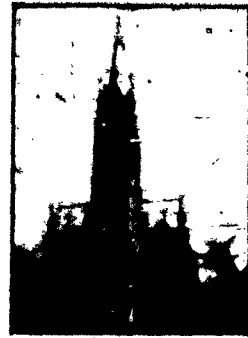
330 GREGORY STREET