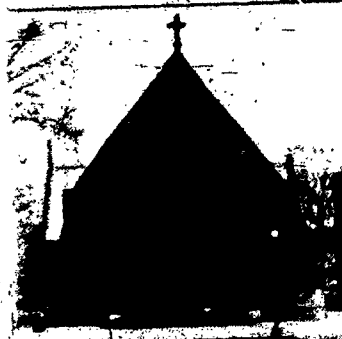
660 MAIN STREET EAST