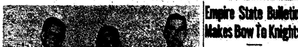
First issue of the Empire State Bulletin published in the interests of New York State Council Knights of Columbus made its appearance this week.

Joining with Knights of Columbus Councils throughout the United States, Canada and the Island possessions, K. of C. units in the Rochester diocese are planning fitting observances of Columbus Day.