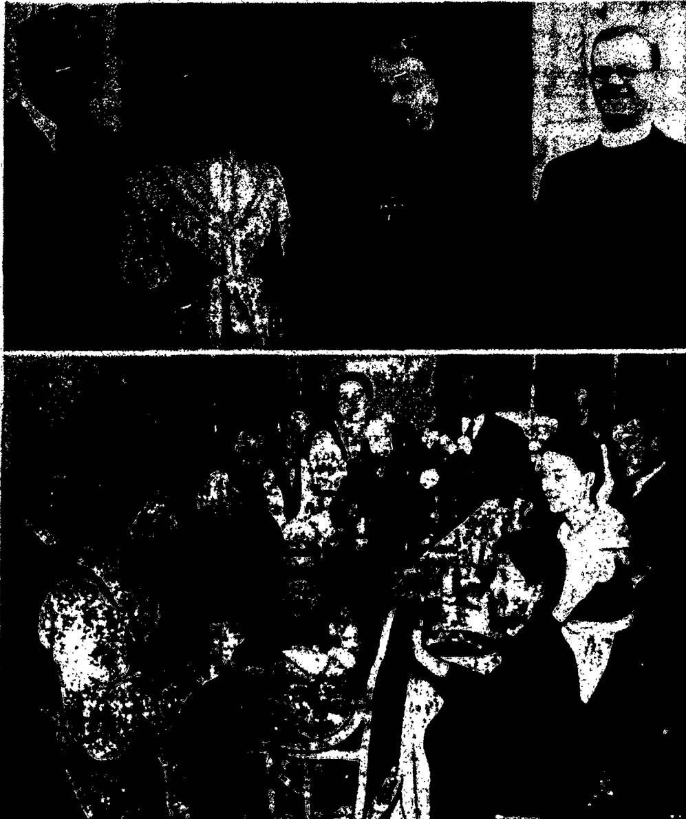
The Trapp Singers, talented Catholic musical family of Austrian Baron Georg von Trapp, took the occasion of their appearance in the Capital to visit the Catholic University of America in Washington for two starlight Chamber concerts.