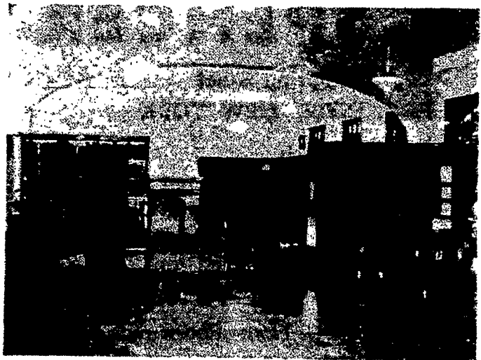
With the tempting fireplace, and the guaranteed quiet of the library, what Merician will not delight to spend a study period in research work or recreational reading?

At the south end of the library are located the stack room and library work room. Metal shelving in the stack room furnishes storage space for magazines and teachers' reference material. The work room is supplied with all necessary equipment for the proper conditioning of library books and reading material.