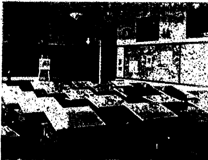
The art room with special bulletin boards, and model shelves is located on the first floor of the new wing. The view of the neighboring grove gives art students an incentive for creative work.

Membership in this class is limited to seniors who have special aptitudes for newspaper work. Each journalistic neophyte is given an opportunity to try her skill at make up work, headline writing, reporting, editing and ad soliciting.