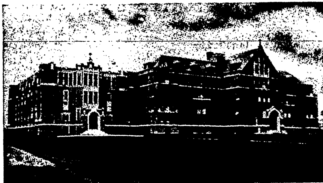
High School And Motherhouse