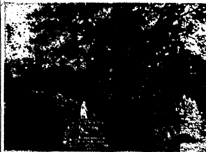
Our Lady's Grotto on the campus at the rear of the school stands on a slight incline casting a protective shadow on blue-uniformed Mercians as they kneel at their Mother's feet. The path that leads to the grotto is well worn by those who make their daily visits to the shrine.