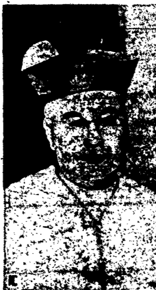
Most Rev. Francis J. Spellman