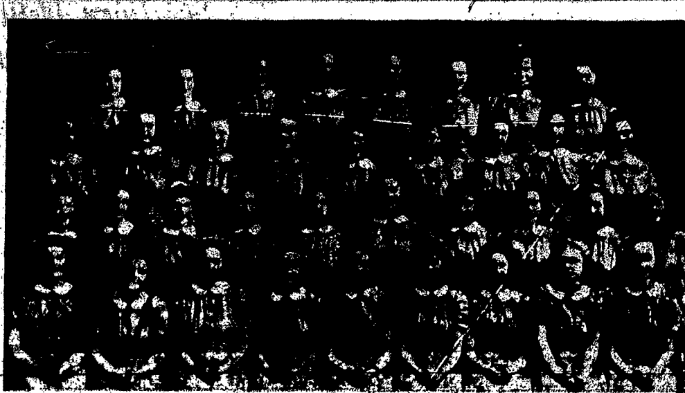
HOW DO YOU LIKE THEM?—these girls of St. Mary's Commercial School are shown wearing their new uniforms for the first time. In these pretty outfits they will participate in the Catholic Students' Mission Crusade events in Rochester opening June 27.