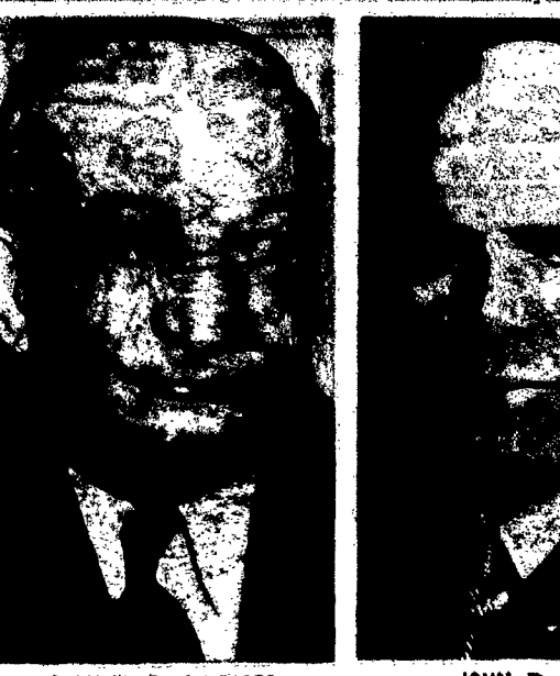
SAMUEL B. DICKER Mayor of the City of Rescheeter