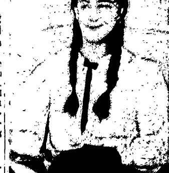
The Holy Names and Rosary Societies of St. Bridget's Church, East Bloomfield, are extending a cordial invitation to all former parishioners and friends to join them for an "Old Home Night" which will include an excellent supper and a musical program.