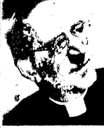
Mgr. E. J. Flanagan

The Rt. Rev. Mgr. Edward J. Flanagan, nationally known and beloved as "Father Flanagan of Boys Town," will be the principal speaker at a dinner dedicating the new Recreation Center of St. Francis Assisi Church in Whitney St., on Sunday, March 9.