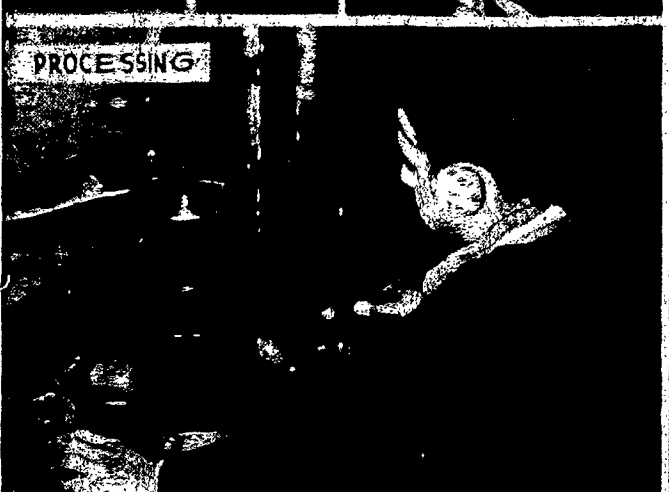
SACRIFICIAL WINE—Steps in the process of making altar wine from the growing of the grapes to the finished product are indicated above