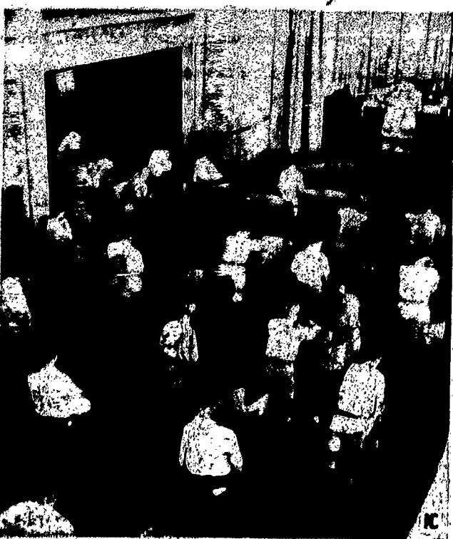
A small section of the spacious social hall of the S. S. America, as the first Mass was celebrated on it during a trial trip.