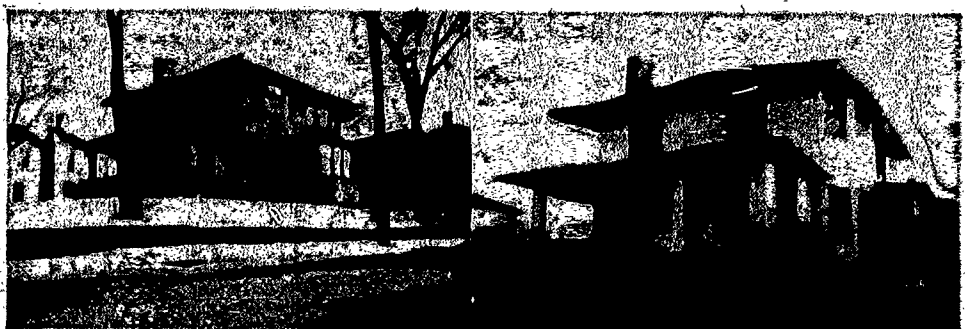
When this home was originally built, since an exterior material was in an experimental stage and freshly painted cladding substituted, the home takes on new beauty. Cost of this work, which is suitable for financing under the Modernization Credit Plan of the Federal Housing Administration, was $1,187 but this HOLO home gained $1,100 in value as a result of the improvement.