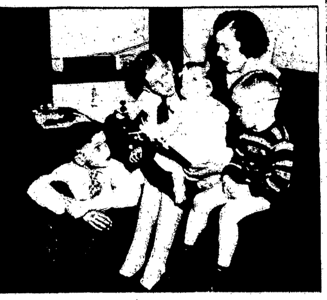
The first and lasting religious lessons are taught in the home. Without the foundation of the Christian family the school can accomplish little.