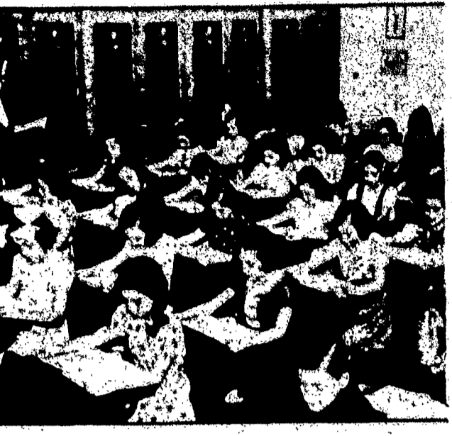
This scene in Our Lady of Good Counsel School is repeated 628 times in the elementary schools of the diocese. The religious atmosphere pervades.