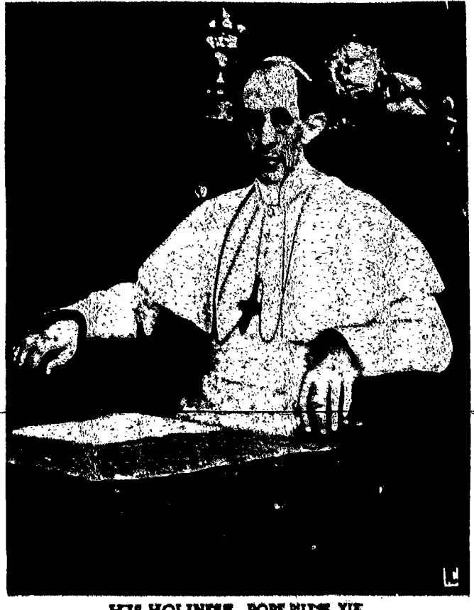
HIS HOLINESS, POPE PIUS XII This official photograph of the Supreme Pontiff shows the Holy Father as he appeared at the close of the first year of his pontificate.