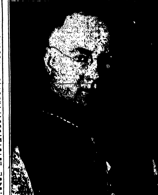
THE MOST REV. FRANCIS J. SPELLMAN, D. D., Archbishop of New York