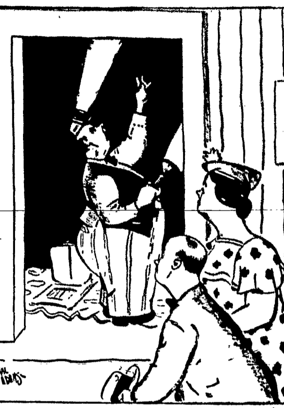
"I STILL CAN'T FIND THAT LIGHT SWITCH!"