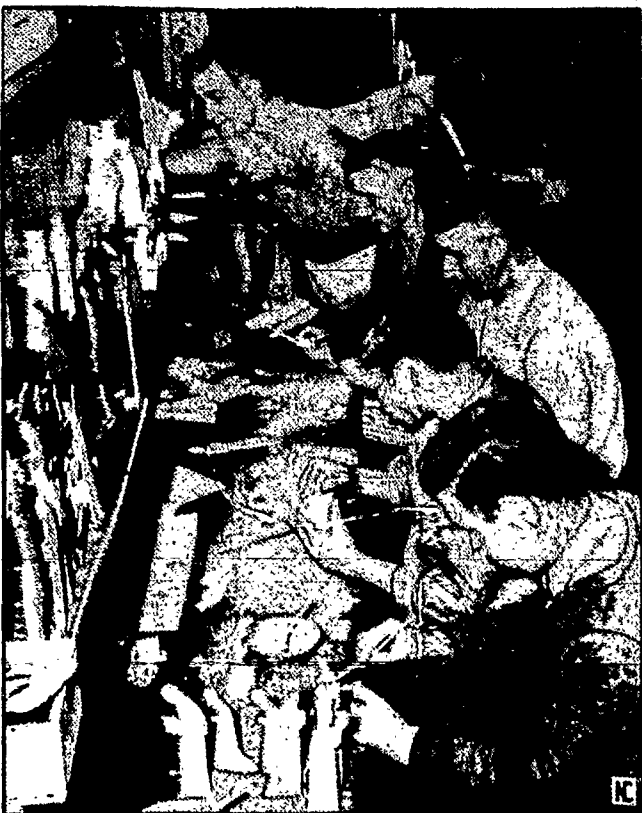
That Christmas crib displayed in the parish school-room, or in your neighbor's home, was probably fashioned by these men, pictured making figures for the Christmas cribs, in the shops of the "Catholic Worker" labor publication, an New York City. Provided with employment here, the men face a greater hope for the future. (NCW C)