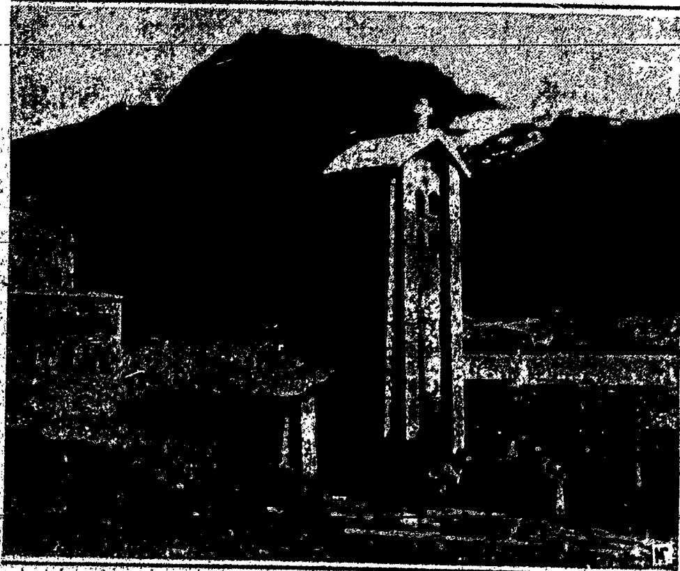
On the highest point on the highest road in Europe, a chapel has been dedicated on Iserein Mountain, France, at an altitude of 9,250 feet. Dedicated to Our Lady of All Prudences, the chapel adjoins a rest house. Many Alpinists from France and England attended the ceremony.