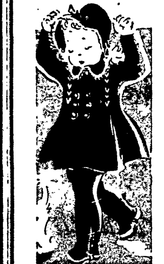
Legging set illustrated, in sizes 2 to 4, is $6.98.

Just at it's LOBEL'S for everything in apparel for children from "birth to graduation"