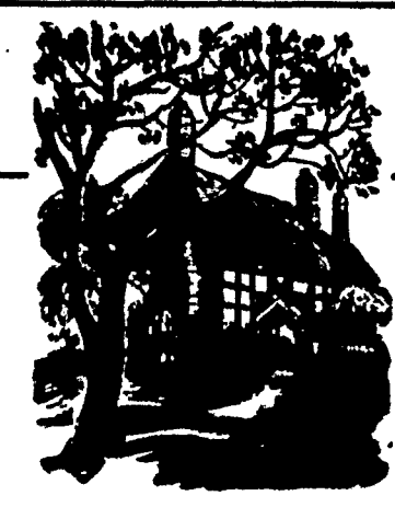
World's Interesting Corners

There are places you should see-places you should visit—nooks and corners of the world that hold interest and thrills for you. Whether you travel, near or far, short or long trips, excursions or vacations, one thing is certain