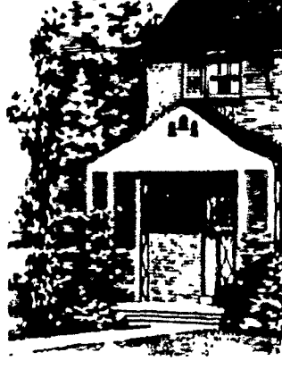
DESIGN N-2 Five Rooms and Bath

Planned for a narrow lot, this simple, sturdy, colonial design in brick veneer construction is definitely a complete and efficient home unit. However, for those who wish more space or where family requirements demand an extra sleeping room or where a spare room for den or sewing purposes is desired, a rear room addition can be provided. A large front porch and all principal rooms cross-ventilated, are features worthy of note.