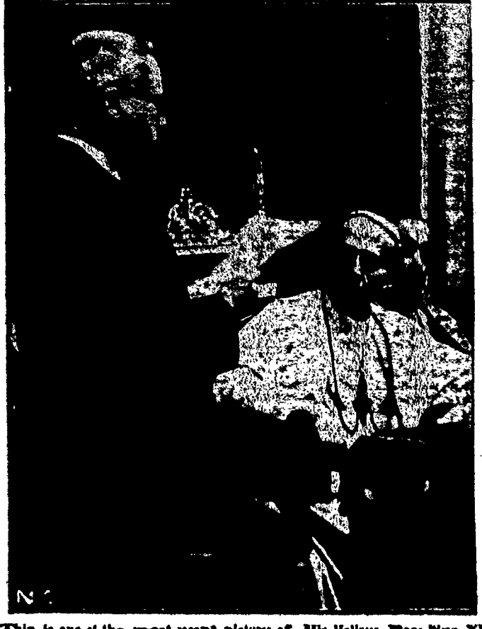
This is one of the most recent pictures of His Holiness Pope Pius XI. It was taken after his return from the Holy Father listening intently to an address read by a representative of the group he was receiving.