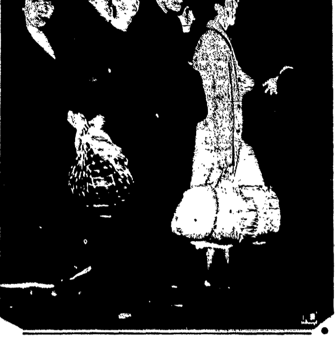
In this photo, taken at the Victoria Railroad Station in London, July 22, is shown some of the Spanish Sisters of the Sacred Heart, whose religious front was Barcelona was obtained through the intervention of the United States Ambassador to Great Britain, Joseph P. Kennedy. Through the aid of the British Foreign Office they were brought to England on the British destroyer "Hera." The refugees nuns will stay at convents in Essex London area.