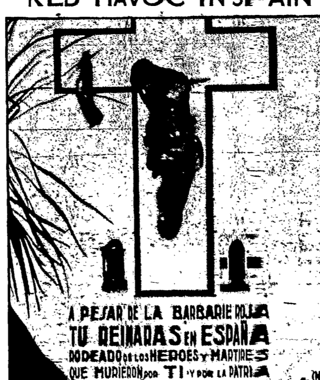
A portion of the Exposition of National Documentation in Bilbao brings together a great many proofs of the savage persecution directed against the Catholic Church and religion in general by the Leftists in Spain. The illustration above shows a figure of the Christ of Ochoanillos (Vizcaya) mutilated by the Leftists.