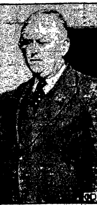
JOSEPH A. BREEN