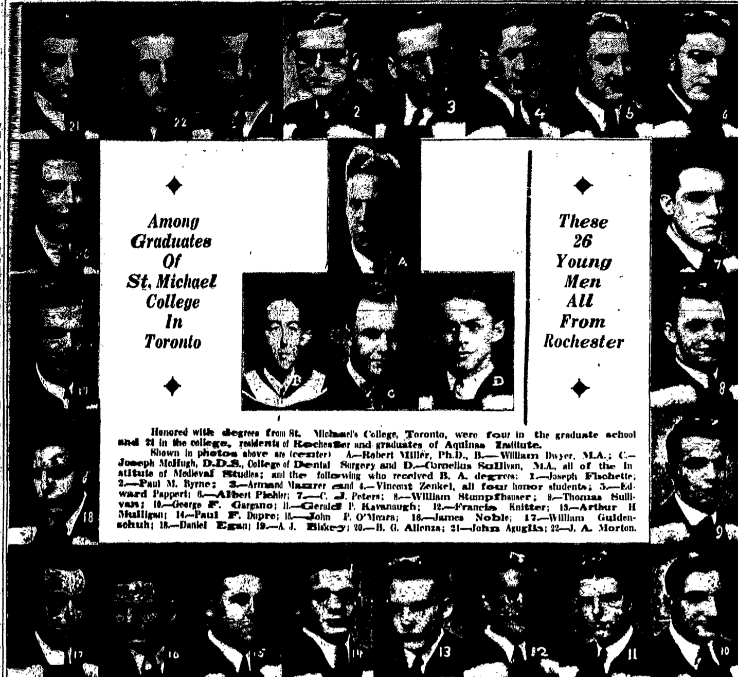
These 26 Young Men All From Rochester