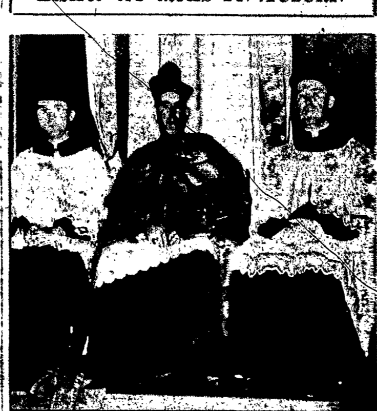
Scenes at services Sunday marking the completion of the redecoration and refurbishing of St. Mary's Church in Auburn, Upper Middlesex, during the Solemn High Mass presided at the Episcopal throne during the Solemn High Mass presided at the Episcopal throne.