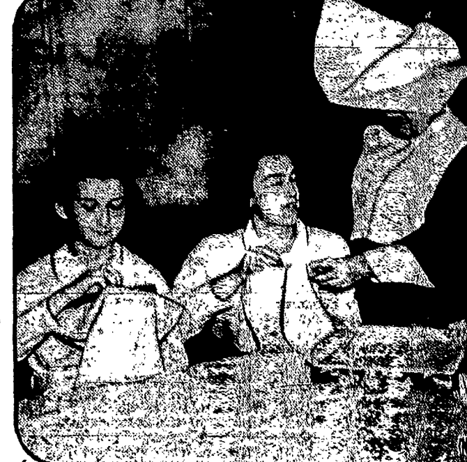
These young needlework experts, of St. Rose's Technical School, Washington, are shown embroidering monograms for Mrs. Eleanor Roosevelt, wife of the President.