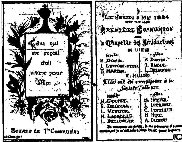
The above is a facsimile of the original First Communion card of St. Therese of Lisieux...