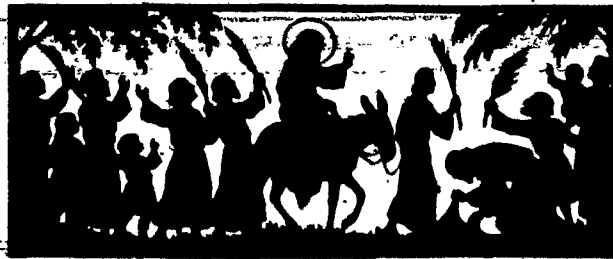
Jesus Rides into Jerusalem on Palm Sunday